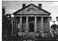
10. Pilgrim Hall Museum

Homestead of famous Pilgrims John and Priscilla Alden. Built in the mid 1600's, the house grew through three centuries into a large, comfortable dwelling occupied by Alden descendants until the 1920's. Furnished with period antiques, the Alden House provides an intimate experience of family life in early New England.